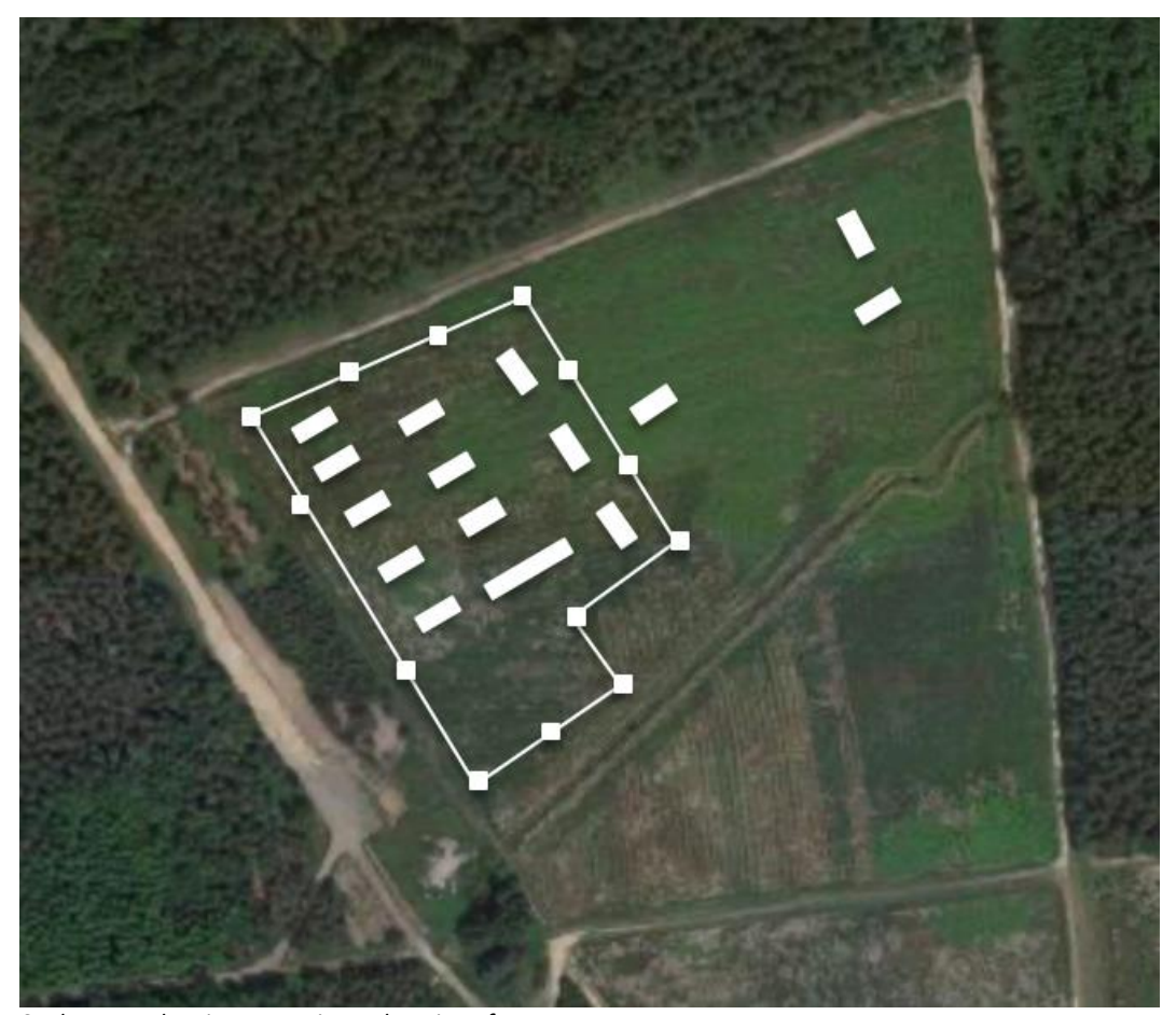
Set\ layout-showing\ approximate\ location\ of\ temporary\ set\ structures

5.2 There are no permanent or fixed structures proposed to be built. Set structures would not exceed 7.8m in height and would be made and constructed in situ and removed at the